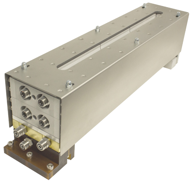
Dual Magnetron Pretreatment Source